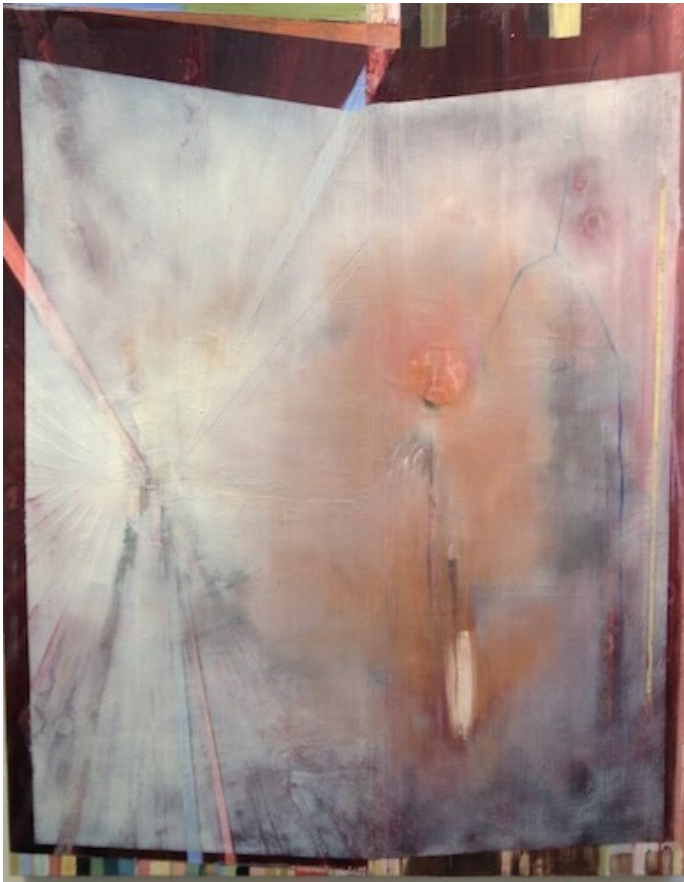
"Temperance" oil on panel, 40" x 60"