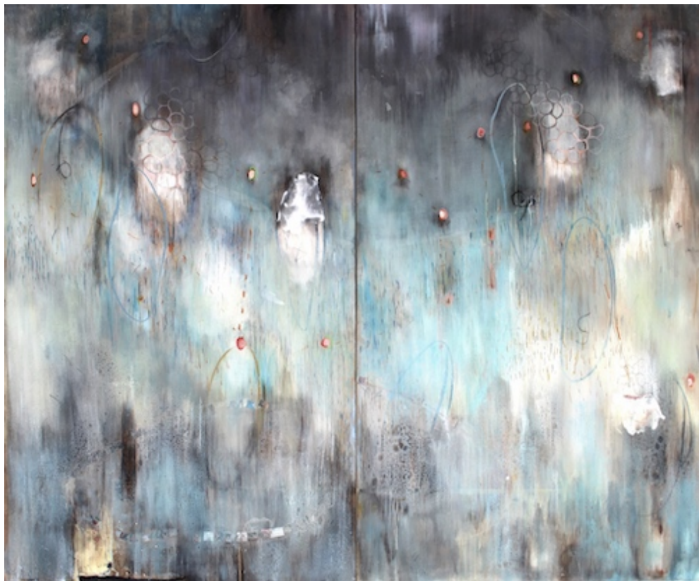
"The Sky is Falling, Anchor the Light" acrylic, oil and wax on panel, 70" x 70"

This dream was the beginning of many more to come; dreams of loved ones passing in our lifetime, a tear in the fabric between life and death. This would become the portal of entry to my life's work—painting.