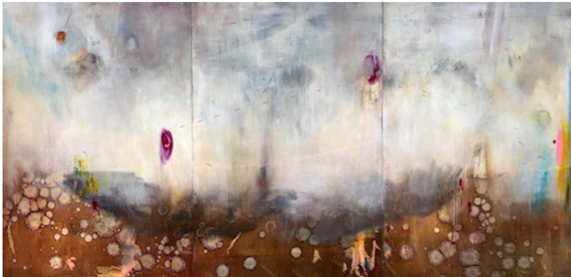
"It Takes Two" oil on panels, 60" x 30"

I am like the temperance card in the traditional tarot deck. An angel with wings, neither male nor female, standing with one foot in water representing the subconscious while the other is on dry land, the material world. The angel holds two cups, mixing waters in a diagonal line, defying gravity. A third thing is created in this magical act of alchemy. Lines are blurred, division and duality answered.