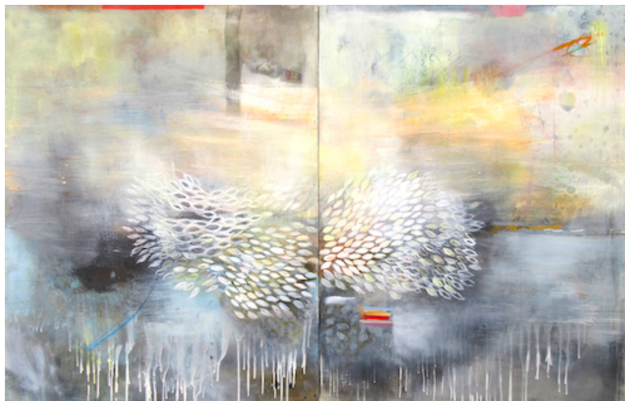
"Grace II" mixed media on panels, 60" x 50"

She flowed up and down and in and out of the deep, dark water, with the silvery moon as a backdrop. She popped her head up and smiled and gave me a wave as I stood on shore—a witness. I could feel the waves of love pouring from her to me. Then she was gone.