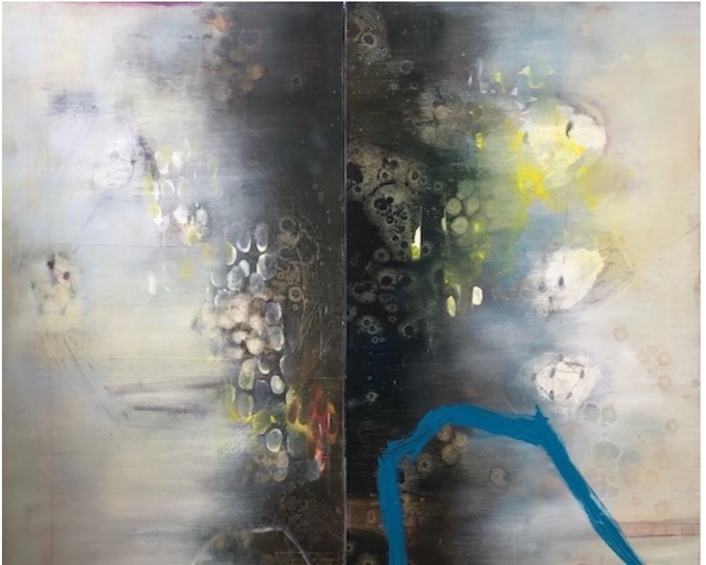
"Mingle" oil and wax on panel, 50" x 30"

I believe we live in a time of a massive infusion of spirit energy. This inpouring of energy also lets in darkness, confusion and chaos. I want to carry the viewer along, serving as a steward of light through the paintings that I make.