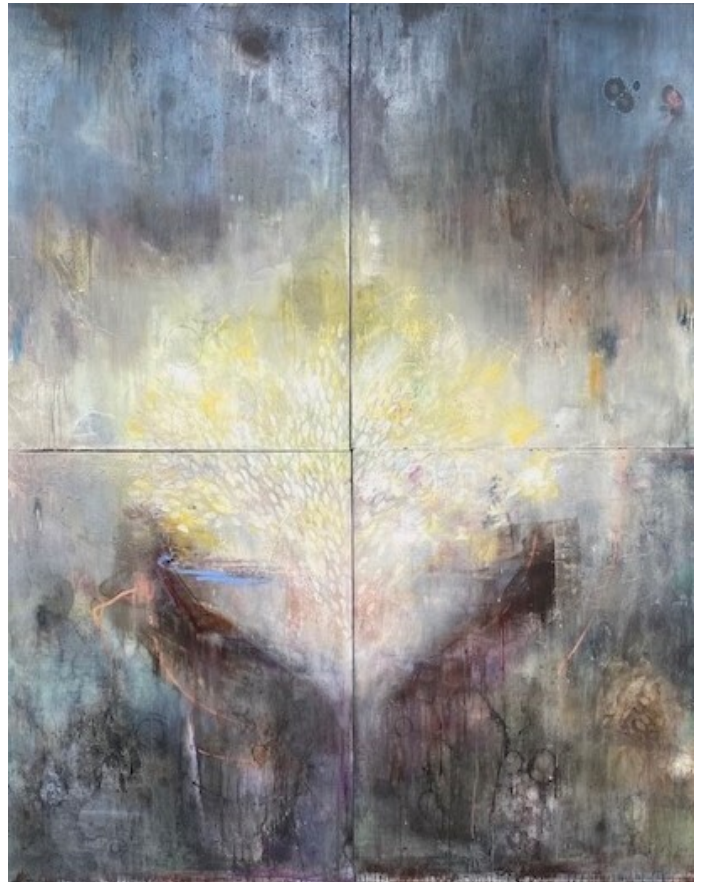
"Beauties Strength" oil on panels, 70" x 70"

As an artist, I was birthed in the abstract language of the academic settings of the nineties. It was a time when formal considerations were separated from the personal. A time when I swallowed my internal beauty. I spent years bifurcating my spiritual connections and experiences from my art making. I truly believed I could separate them, but I couldn't.