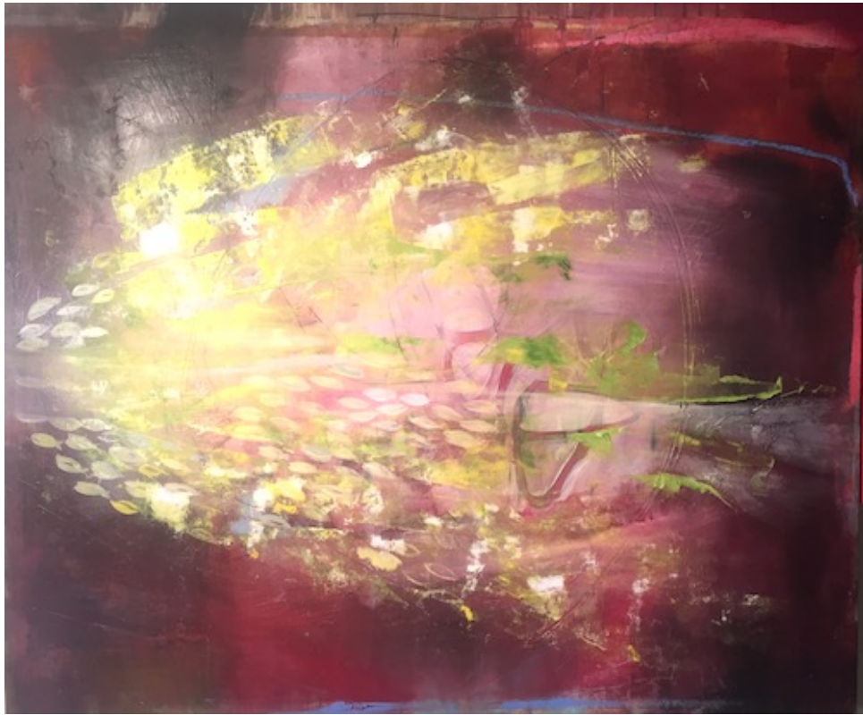
"Imaginary Friend" oil and cold wax on panel, 55" x 48"

I am like the temperance card in the traditional tarot deck. An angel with wings, neither male nor female, standing with one foot in water representing the subconscious while the other is on dry land, the material world. The angel holds two cups, mixing waters in a diagonal line, defying gravity. A third thing is created in this magical act of alchemy. Lines are blurred, division and duality answered.