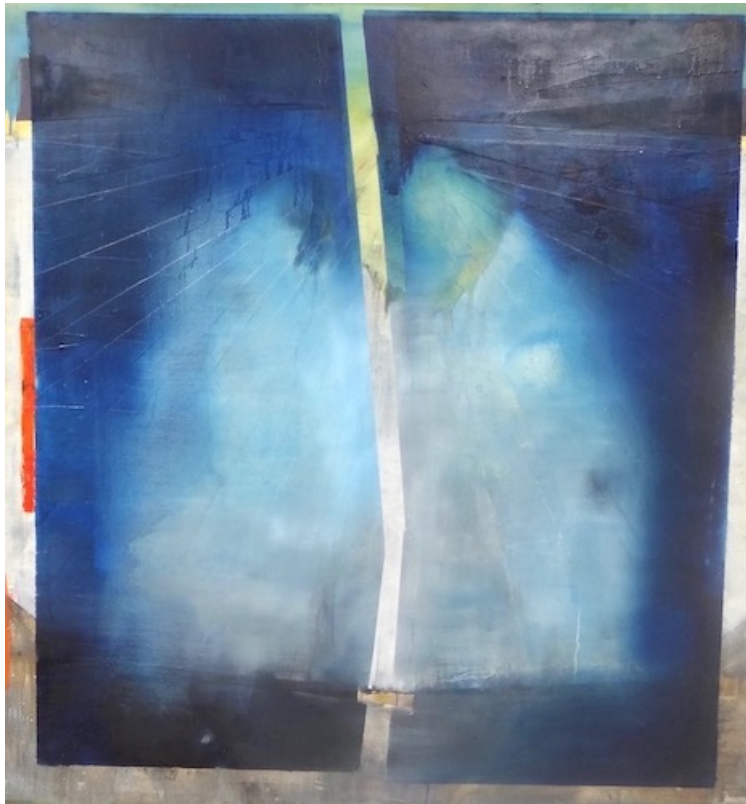
"Heart Space" oil on panel, 46" x 46"

She flowed up and down and in and out of the deep, dark water, with the silvery moon as a backdrop. She popped her head up and smiled and gave me a wave as I stood on shore—a witness. I could feel the waves of love pouring from her to me. Then she was gone.