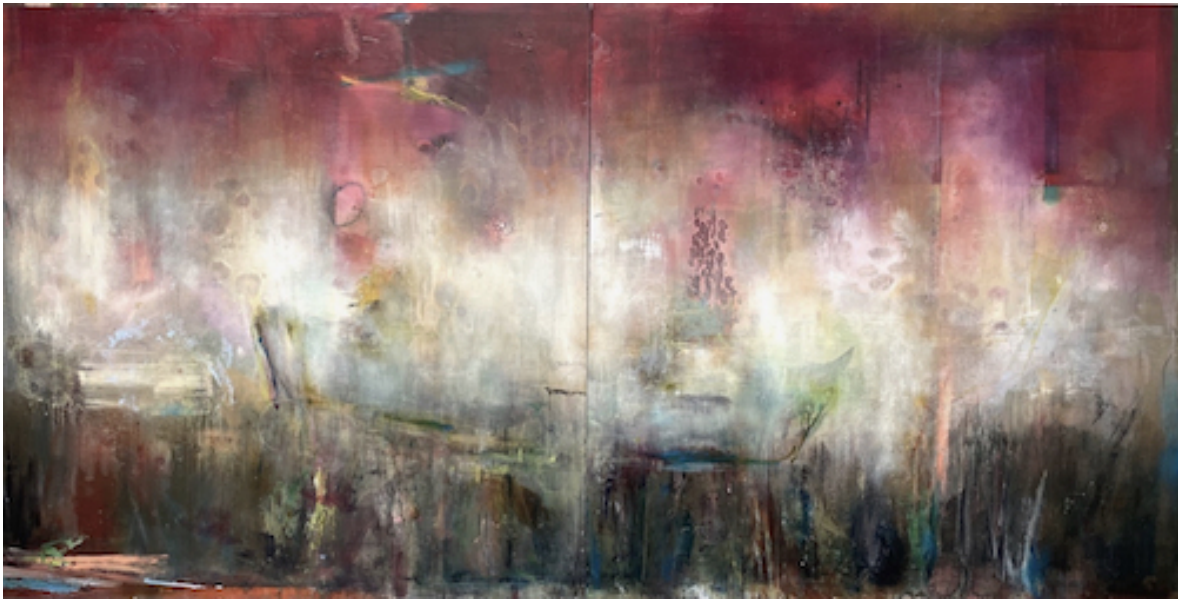
"Long Passage" oil on panels, 96" x 48"

This dream was the beginning of many more to come; dreams of loved ones passing in our lifetime, a tear in the fabric between life and death. This would become the portal of entry to my life's work—painting.